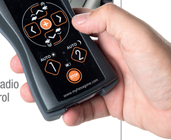
Waterproof radio remote control

The warranty is 2 years parts and labour. (Excluding consumables).