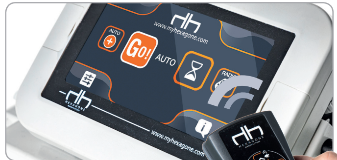
Color Touch Screen